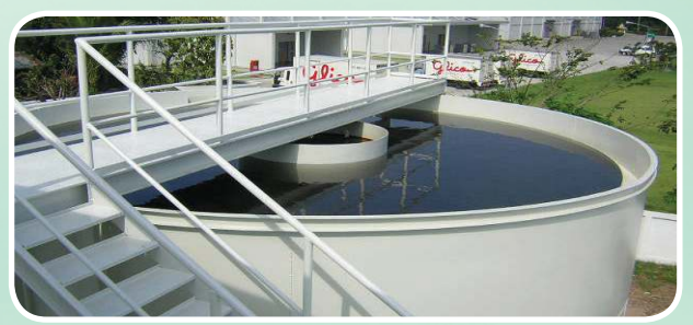
Wastewater Treatment Plant 1,200 m³/day, Electronics Factory