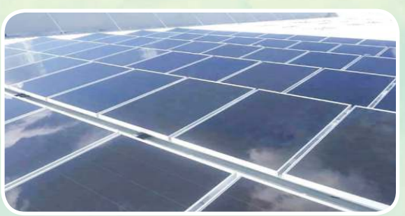
Solar Rooftop Plant