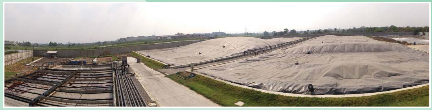
Capacity of wastewater 2,000 m<sup>3</sup>/day, COD 6,500 mg/l, Biogas Production 4,000 m<sup>3</sup>/day, Coconut Milk Processing Factory