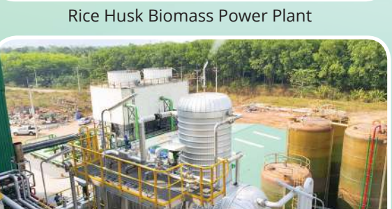
Cooling Tower and Balance of Plant