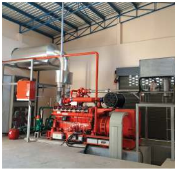
Gas Engine Generator, Palm Oil Mill