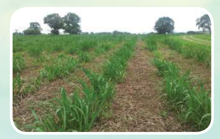
Napier Grasses Plantation. Prachuap Khiri Khan Province