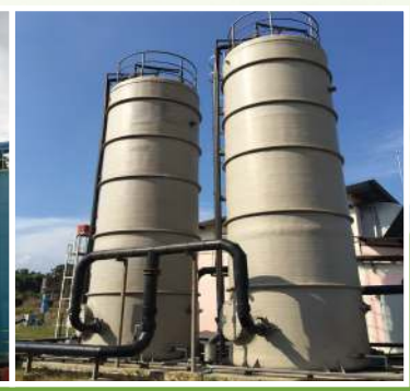
Biogas Upgrading and H<sub>2</sub>S Bio-Scrubber System, Palm Oil Mill