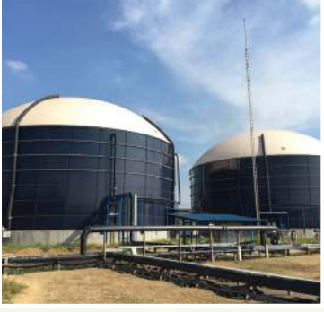
Capacity of wastewater 225 m³/day, COD 100,235 mg/l, Biogas Production 10,000-17,000 m<sup>3</sup>/day with Power Generation 2 MW, Palm Oil Mill