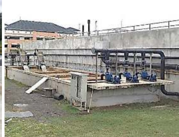
Capacity of wastewater 4,000 m<sup>3</sup>/day, COD 2,500 mg/l, Biogas Production 2,400 m<sup>3</sup>/day, Tuna Processing Factory