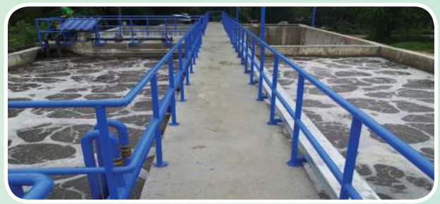
Wastewater Treatment Plant 1,200 m³/day, Resort