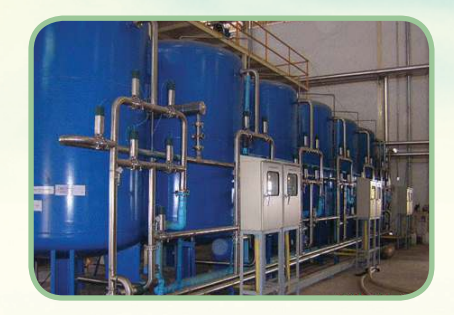
Demineralized Water Supplies