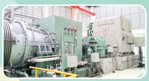
Steam Turbine Generator