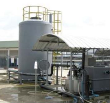
Capacity of wastewater 2,500 m<sup>3</sup>/day, COD 3,000 mg/l, Biogas Production 2,200 m³/day, Frozen Foods Factory